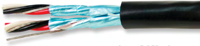
Series E1BED - Pairs