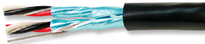
Series E1BFD - Pairs